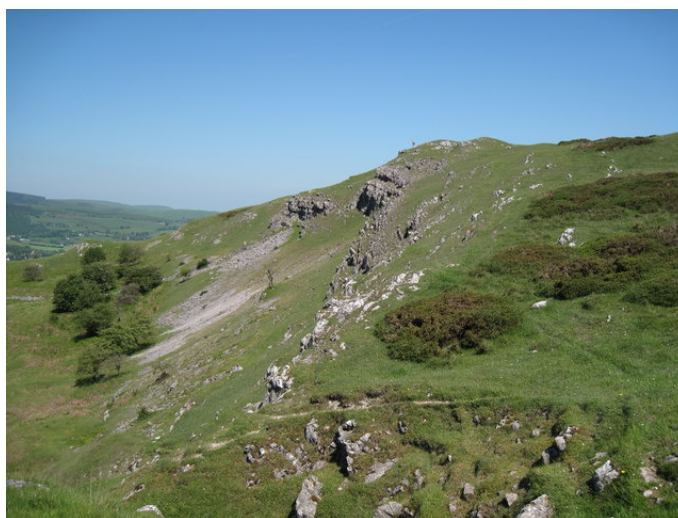
Limestone cliffs, part of Bryn Alyn SSSI