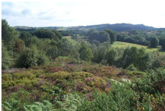
Moel Findeg Local Nature Reserve

A fifth – Prestatyn Hillside – is in the process of being designated.