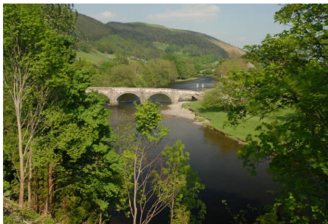
The River Dee at Carrog – part of the River Dee and Bala Lake SAC