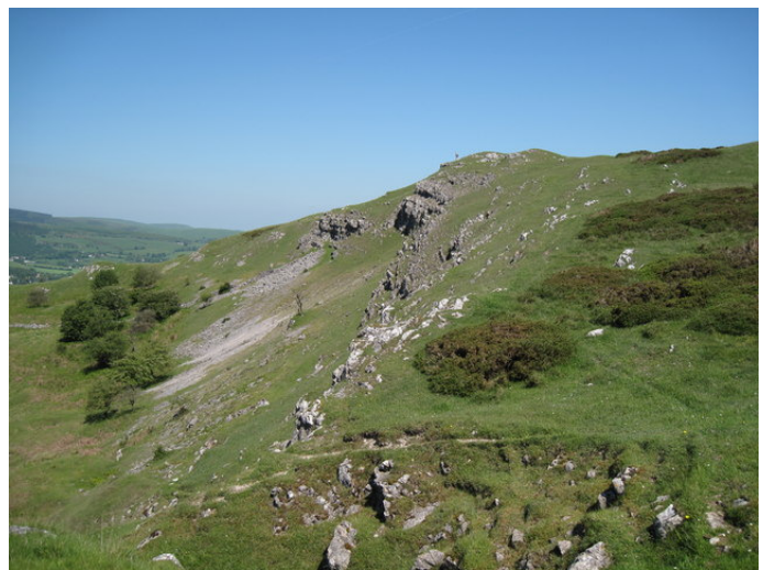
Limestone cliffs, part of Bryn Alyn SSSI