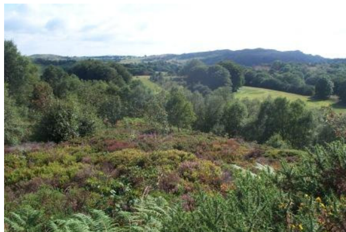
Moel Findeg Local Nature Reserve

A fifth – Prestatyn Hillside – is in the process of being designated.