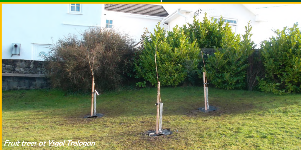
Fruit trees at Ysgol Trelogan