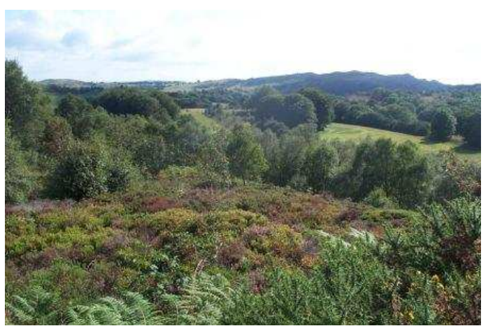
Moel Findeg Local Nature Reserve

Denbighshire County Council has designated four Local Nature Reserves, all of which are managed by the Countryside Service. They are: