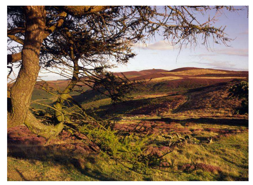
Clwydian Range Area of Outstanding Natural Beauty.

Protected by law because of their special landscape gualities, they have more protection than other areas under the planning process and, in terms of landscape and scenery, are equal to National Parks. They are dynamic, working landscapes supporting vibrant communities and as most of the areas are in private ownership, creating successful partnerships to ensure sympathetic land management is key to their management. All AONBs are required to produce a management plan through consultation with local communities, organisations and