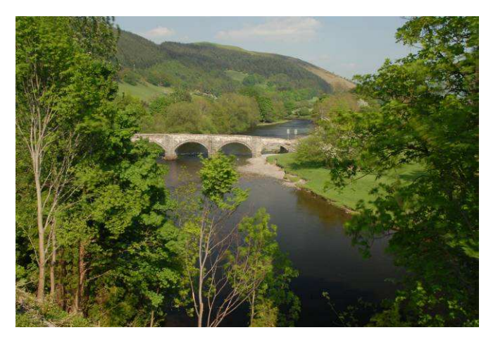
The River Dee at Carrog – part of the River Dee and Bala Lake SAC