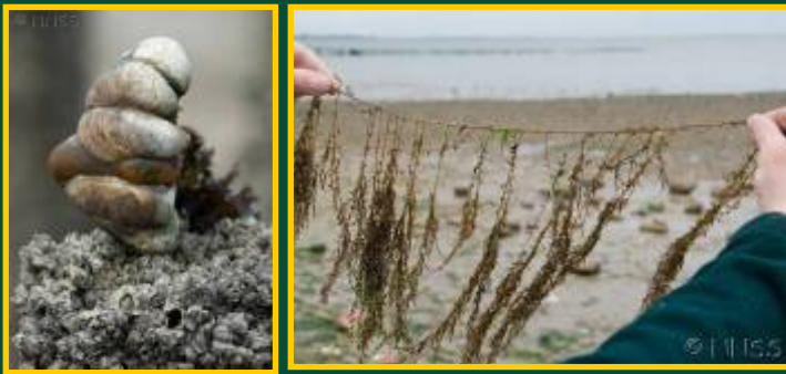
Above: slipper limpet, wireweed.

SeaLife Tracker: http://naturelocator.org/sealife.html AqualInvaders: http://naturelocator.org/aqualinvaders.html