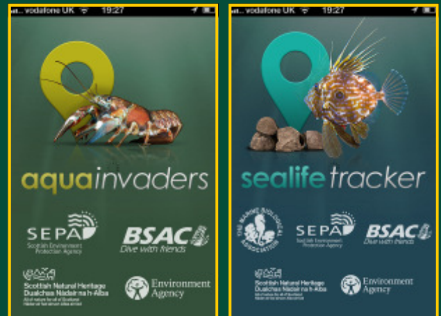
Above: this is how the apps will appear