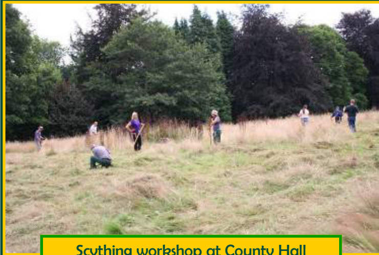
Scything workshop at County Hall

To successfully manage a meadow for biodiversity and to encourage wildflower growth the area only needs to be cut once or twice a year and the resulting cuttings need to be removed from the site. This is so that nutrients produced by the cuttings composting down do not leach back into the soil because wildflowers prefer nutrient poor soils. If soil is nutrient rich, vigorous grasses can take over preventing other species from growing and reproducing. Ideally an early cut would be taken but the bad weather early on this year prevented this from happening.