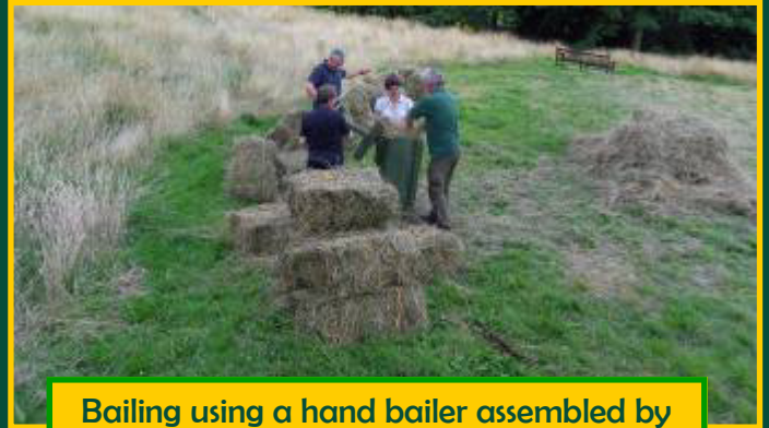
Bailing using a hand bailer assembled by North Wales Wildlife Trust

traditional meadow cutting experience, although the lack of cider at lunch time was noted!