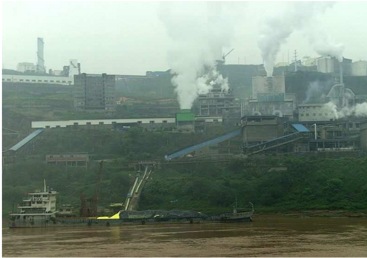
The UK has done a lot of work to clean up rivers, but some rivers in other countries are heavily polluted such as the Yangtze River in China (High Contrast)

Single source pollution, such as sewage or industrial effluent can be easily monitored but