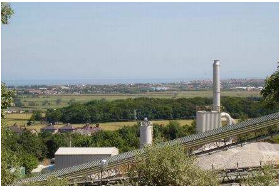
Industry, housing and intensively farmed land has fragmented much of our countryside

The UK is a relatively small collection of islands with a large human population where there are many demands on the land. The building of roads, industry or housing has often taken priority over nature conservation. Even if habitats are not wholly destroyed they may be fragmented (broken up) into very small areas, which may be too small for their plant and animal communities to remain viable.