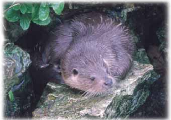
Caiff dyfrgwn gyfle i ffynnu yn nyfroedd glân yr Afon Ddyfrdwy Otters thrive in the clean waters of the River Dee

The hillfort was built in the Iron Age, sometime between 800BC and 43AD on a hill overlooking Corwen. Unlike other hillforts in this area Caer Drewyn doesn't have earthen banks and ditches but a large dry stonewall. Inside part of the hillfort you can see remains of the stone foundations of some round houses.